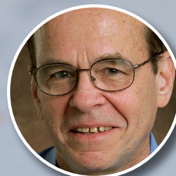
Barry Sharpless Nobel Prize 2001