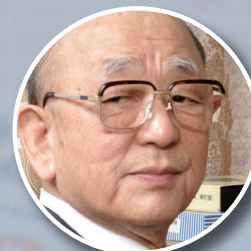
Akira Suzuki Nobel Prize 2010