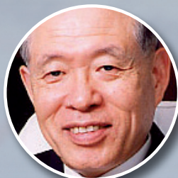
Ryoji Noyori Nobel Prize 2001