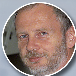
Hartmut Michel Nobel Prize 1988