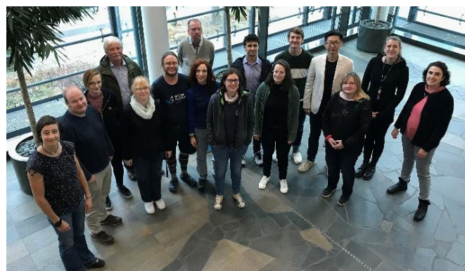
Figure 1. Colleagues at the Department of Ecological Chemistry in November, 2022.

suitable experimental design and specific target analysis as well as models to predict their behavior in abiotic environmental compartments and organisms.